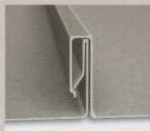
SL-1750 AFTER LOCKING